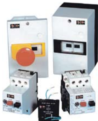
Time Current Characteristic Mean values of operating times for MPE